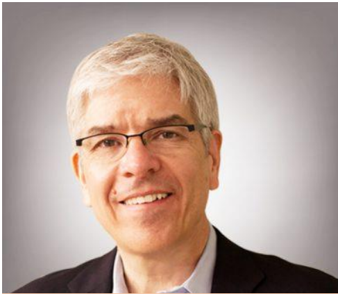
Dr Paul Romer Chief Economist & Senior VP of the World Bank

Shared his insights on how ideas and technological discoveries are the driving engines of economic growth